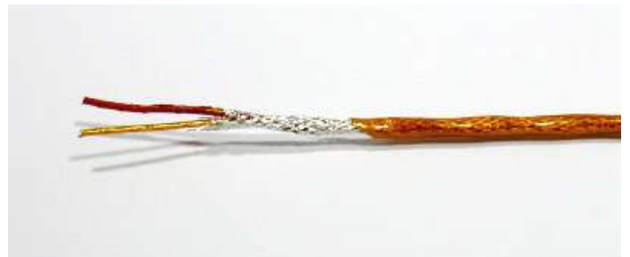
Shielded twisted pair cable, 1 pair

Allectra offers two versions of shielded twisted pair cables with one and two pairs.